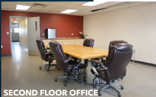
SECOND FLOOR OFFICE